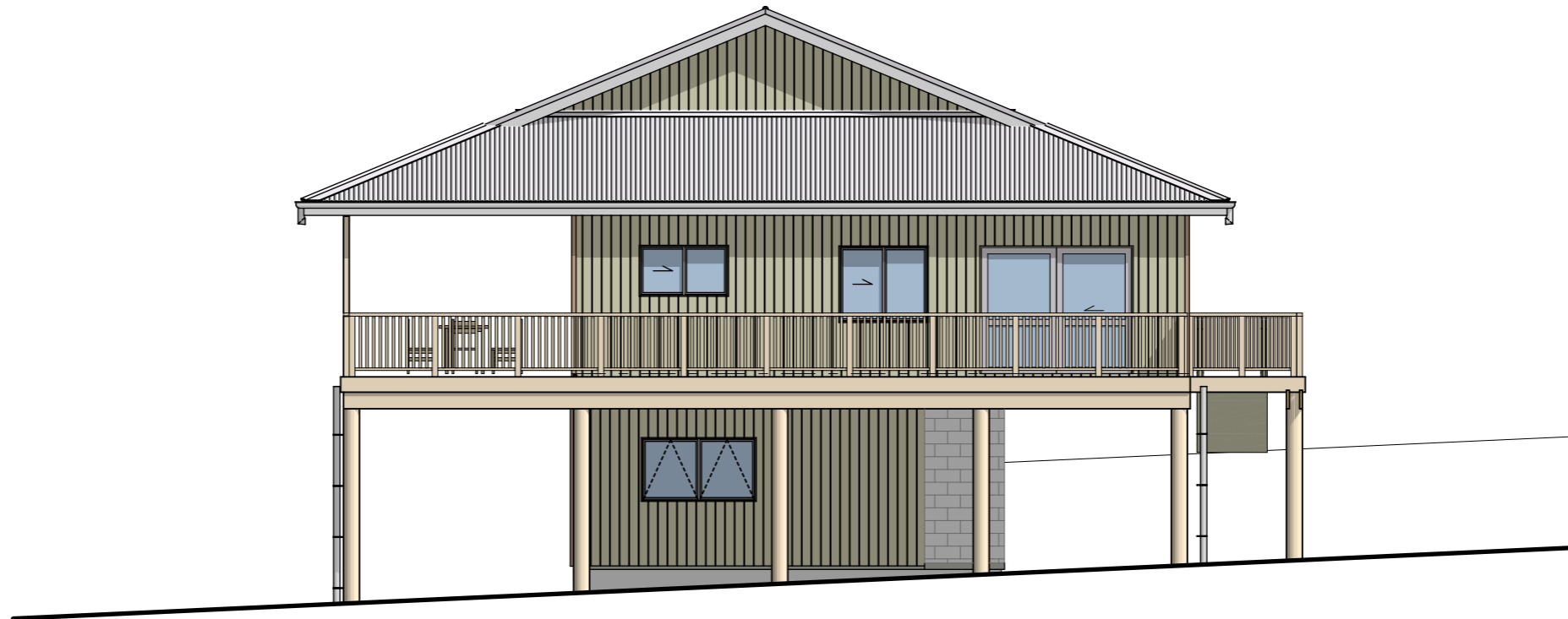
Side Elevation 1:100