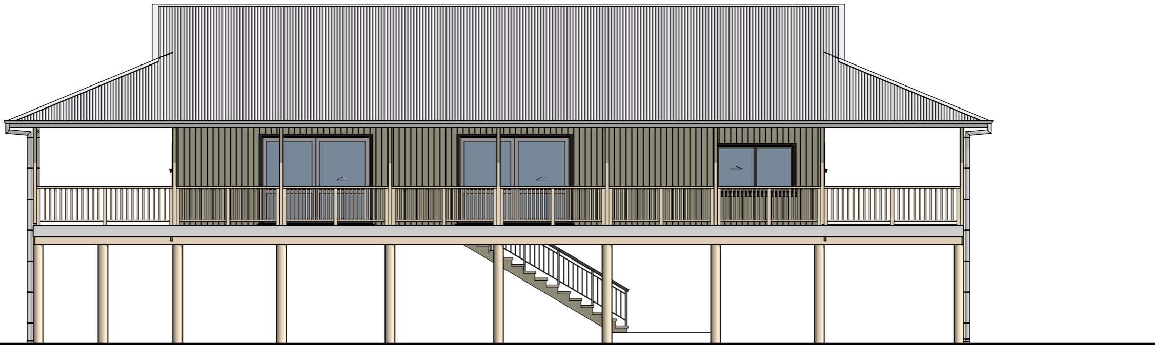
Front Elevation 1:100