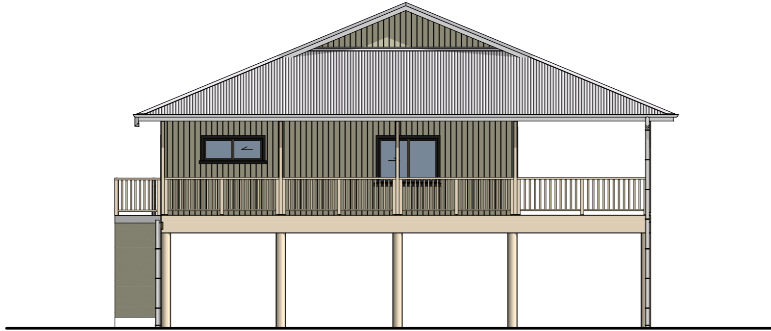
Side Elevation 1:100