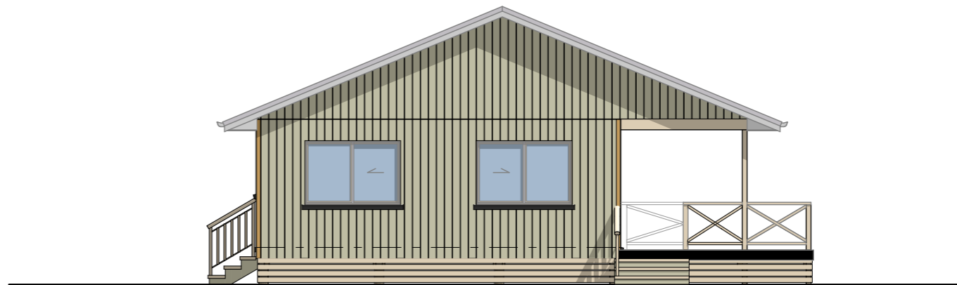
○ ————— Side Elevation 1:100