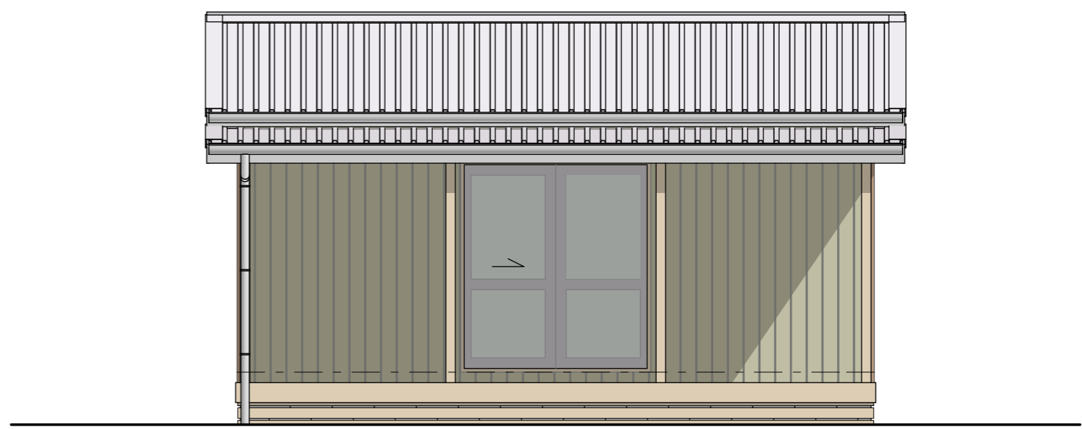
○ Front Elevation 1:50